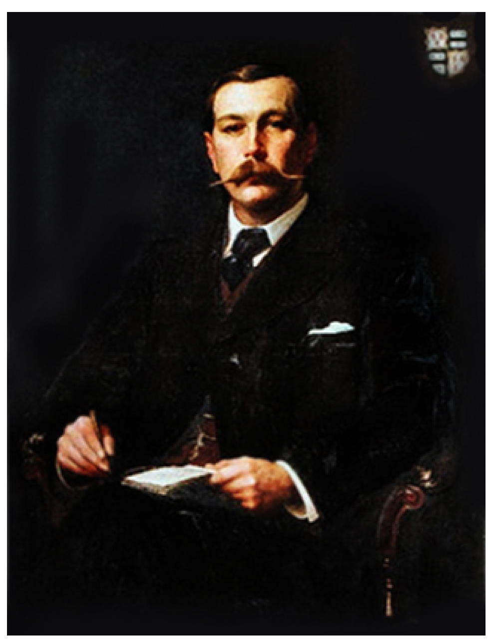
Asthur Con an Dogle.